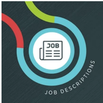
Image: Image: Illustration by Vasil Nazar